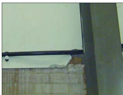
This damaged AIB needs to be covered and protected from further damage